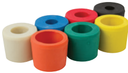
Grommets Each color sold separately (Bag of 5)